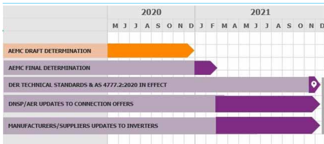
Figure 7.1: Implementation approach