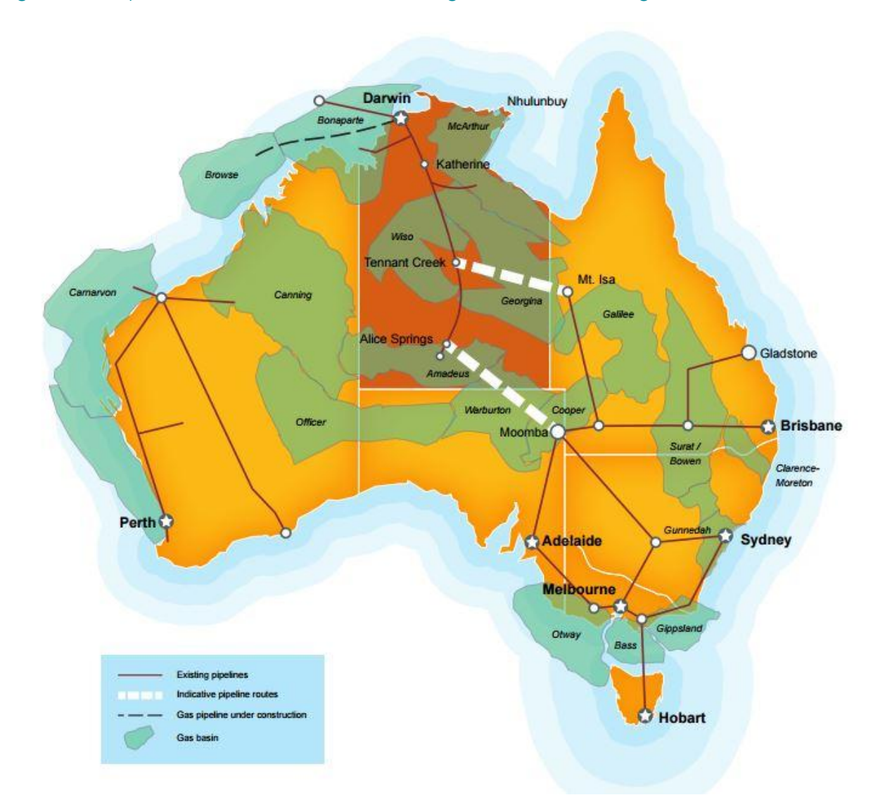
Figure 2.1 below is a simplified diagram of Australia's gas pipeline network released with the NEGI tender. It indicates that gas from the Northern Territory competes with gas from east coast sources, such as the Cooper, Surat/Bowen, Gippsland, Bass and Otway basins.